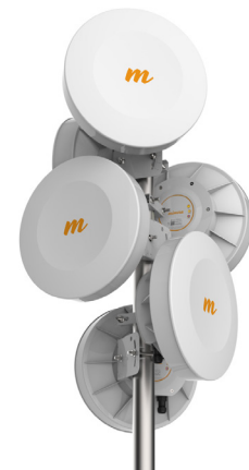
B5 - 6 Dish Collocation